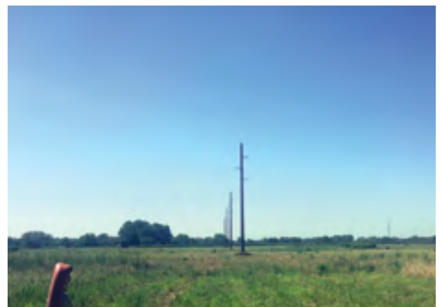
Pictured above - Poles set and ready for stringing.