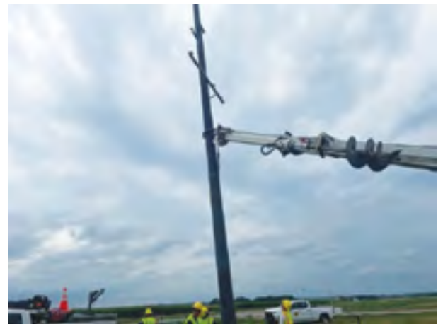
Pictured above - Crews setting a pole for the 34.5 kV transmission line build project.