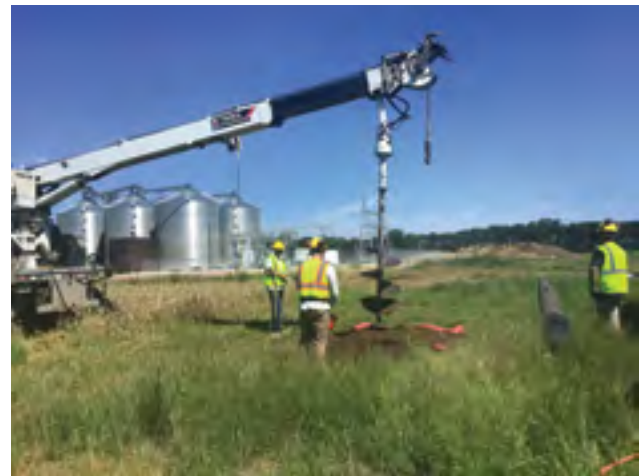
Pictured above - Crews digging a hole for a pole for a 34.5 kV transmission line build project.