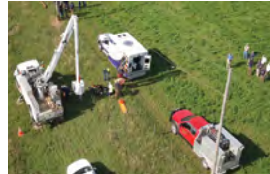
Pictured left: Aerial view of the Mock Mayday scenario performed in July with the Battle Creek VFD and Rescue.