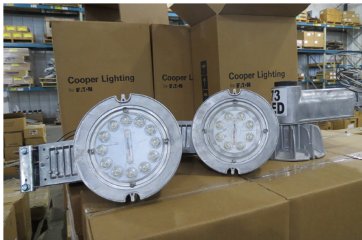
New energy saving LED street lights

Elkhorn crews have been changing out the old security lights in the towns of Hadar, Clearwater, Ewing and Elgin; and in the rural areas, as requested or as the old ones fail, to the more efficient LEDs (light emitting diodes). We have had good reports from customers on these lights, because the light is focused on the ground and not shining in windows. LEDs put out the same or more light and operate on about half of the power used by the newer high pressure sodium lights and about one third or one fourth of the older mercury vapor lights.