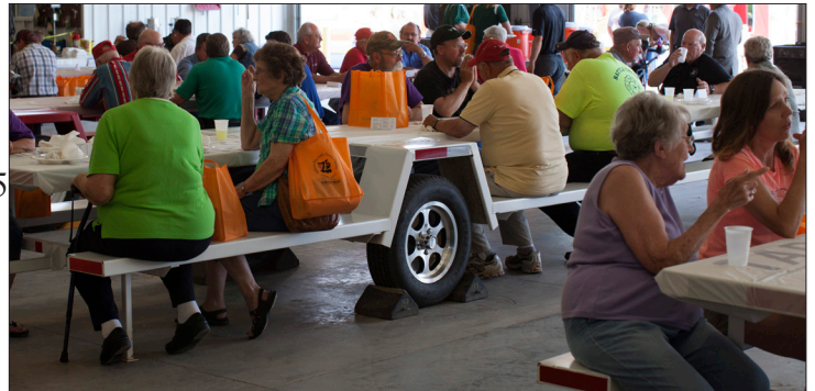
Customer-owners at Elkhorn's 75th Celebration in 2015.

Elkhorn RPPD believes this special bond and obligation to be an integral part of the community. We understand that you can't sell electricity to a business that has closed its doors, or to people that have left the community because there are not enough local opportunities. Electricity is a critical