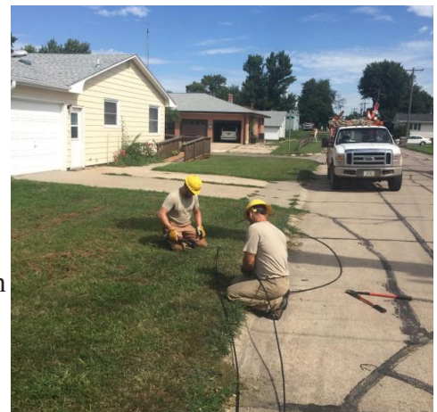
Crew working in Elgin stringing new wire.

Thank you to all Elgin residents for your patience and working with us to get this completed in a safe and timely fashion.