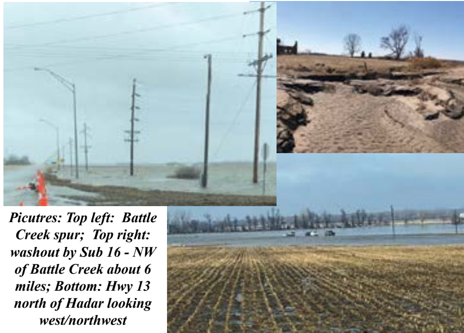
Pictures: Top left: Battle Creek spur; Top right: washout by Sub 16 - NW of Battle Creek about 6 miles; Bottom: Hwy 13 north of Hadar looking west/northwest

We are truly blessed to be able to serve you all during good times and not so good times.