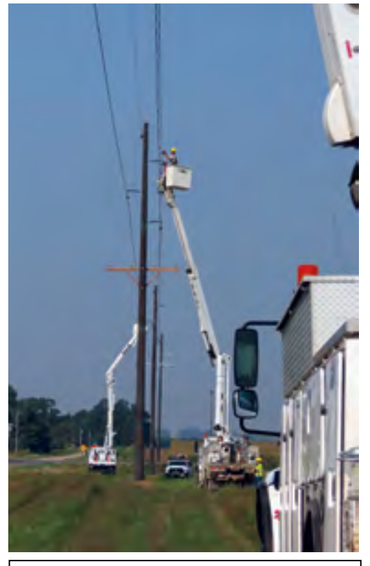
Crews tie in the sub-transmission line for Norfolk Crush - one of 2023 highlights.