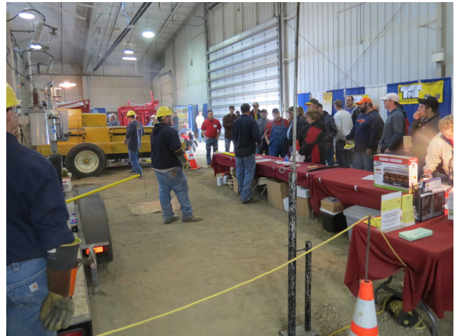
A team of linemen from Elkhorn RPPD and Stanton Co PPD perform a safety demonstration using a high voltage demonstration trailer.