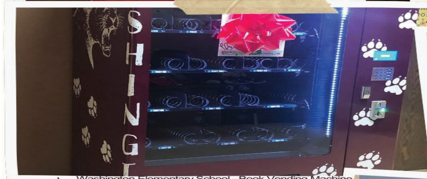
Washington Elementary School - Book Vending Machine