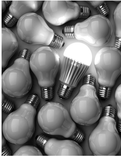
LEDs can save energy and money. $3 rebate ends December 31.

tain no mercury. LEDs generate almost no heat and many bulbs are dimmable.