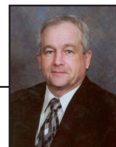
Mark Miller Subdivision I