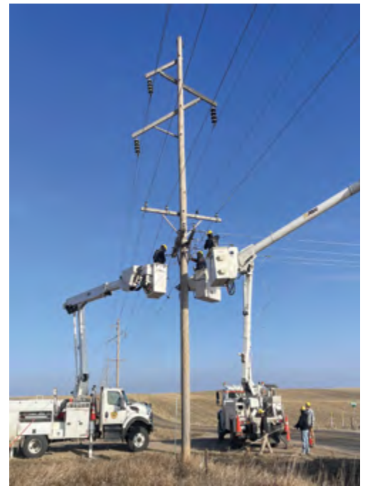
Crews work to install services and maintain ERPPD's electrical grid, efficiently. This helps with capacity, reliability and the cost-effectiveness of your electrical service.