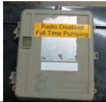
Pictured right: If you go to full time pumping, Marc will be coming to your box to remove the load control switch.