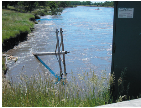
Elkhorn River northeast of Tilden