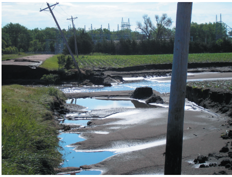
South of Neligh on Airport Road