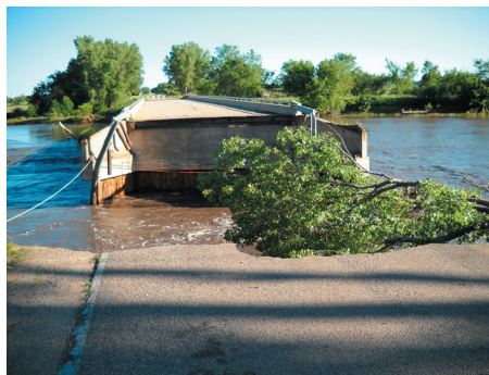
Bridge north of Meadow Grove