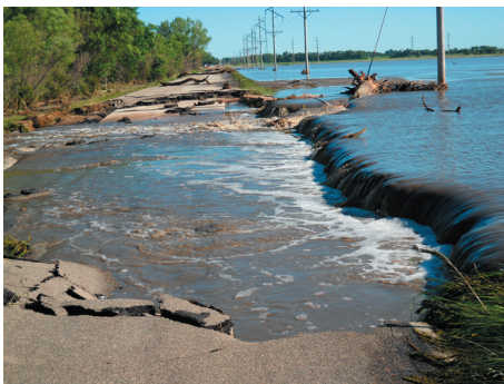
County road north of Battle Creek