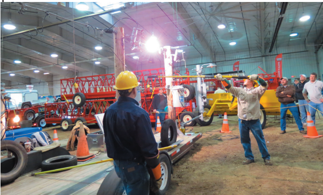
Safety demo team showing the power of electricity as it takes a shortcut to the ground.

they will not become part of that shortcut to the ground.