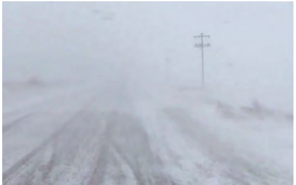
Visibility was greatly reduced during Winter Storm “Jaxon”. ERPPD system did not falter even with these conditions, keeping our customers safe and warm.

System reliability is also important for keeping our employees and